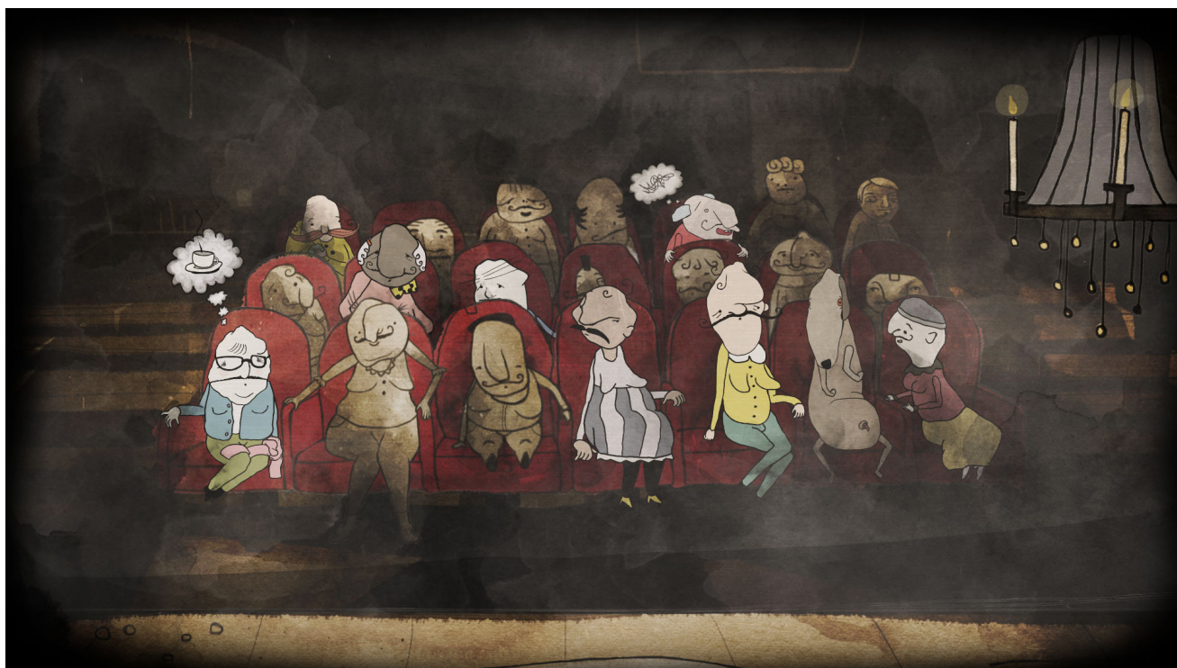
PREFERRED STILL ABOVE.